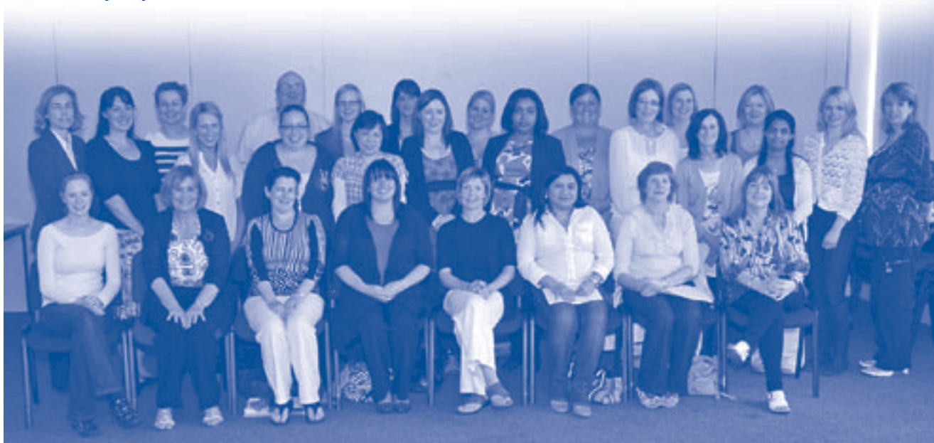
Delegates and two of the organisers on the last day of the programme after presentation of certificates of attendance